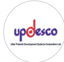
UP Development Systems Corporation Ltd.